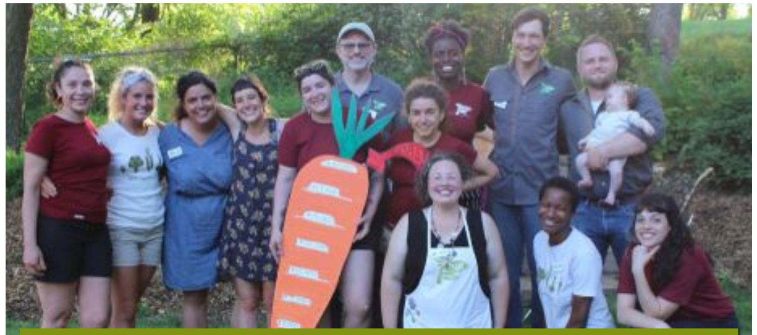
2018 was our most successful Omaha Gives fundraiser ever, with nearly 300 individuals donating over $25,000 to support our programs! We are incredibly thankful for that support! THANK YOU!

The Big Garden's mission is to cultivate food security by developing community gardens, creating opportunities to serve, and providing education on issues related to hunger.